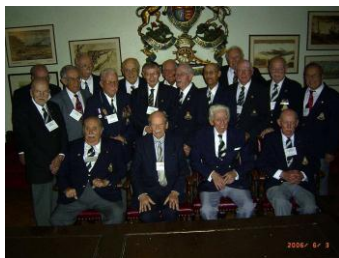
Montreal reunion in June 2006