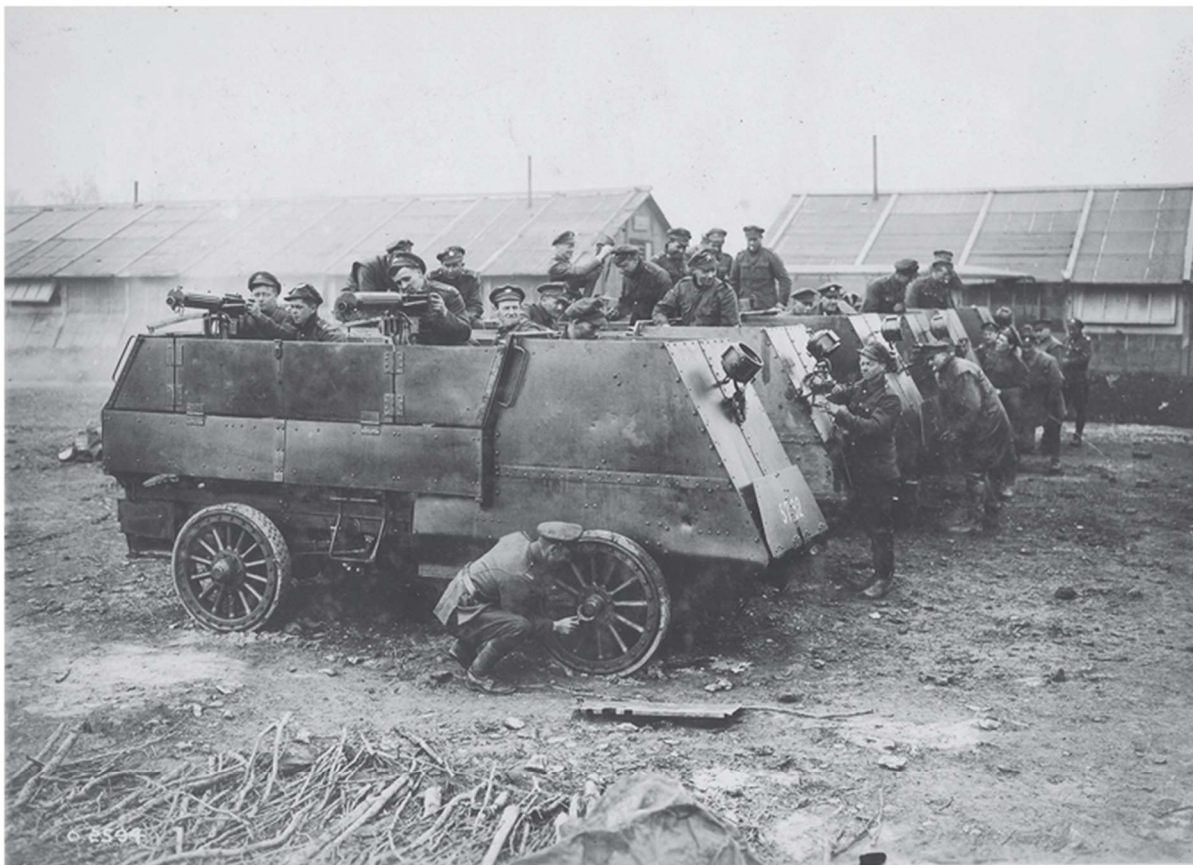
Figure 20.2. Original Brutinel armoured machine gun batteries, which became Batteries A and B of 1st Canadian Motor Machine Gun Brigade in 1916.