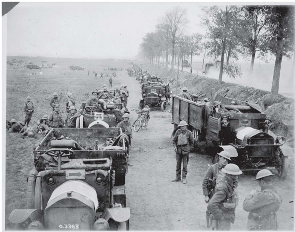
Figure 20.5. Canadian Motor Machine Gun Brigade waiting alongside the Arras-Cambrai Road, August 1918; this picture shows the motor machine gun batteries which, like the Borden Battery, did not use armoured vehicles but carried men, guns, and supplies on trucks. The Borden Battery might have looked like this as it went into action in March 1918.