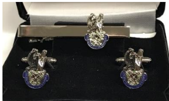
BLAZER CRESTS AND & NEW TIE CLIP AND CUFFLINKS