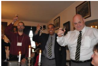
To the ladies