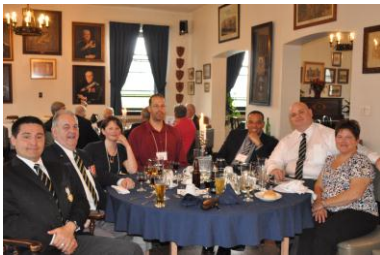
The Barrette, Chatillion, Chevalier, Greene, and Weekes Table