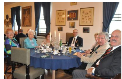
The Charron, Hamilton & Lutes Table