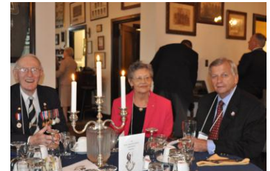
The Highway, and Pichette Table