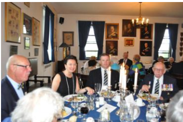
The Head Table