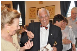
The Desert Table was loved by one and all!