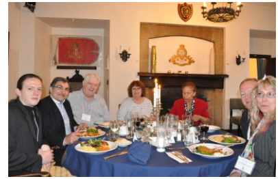
The Ami, Ciarroni, Regimbal Table