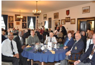
The Edwards, Favreau, Hetu, Kirkwood, and Wooley Table