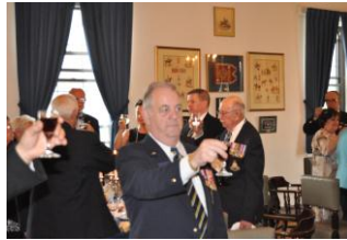
A Toast to Fallen Comrades